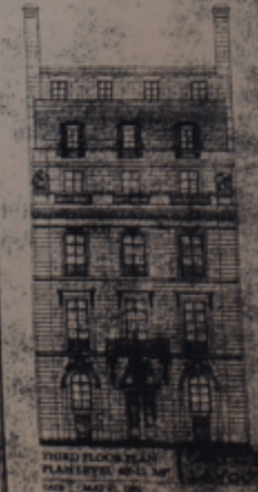
THIRD FLOOR PLAN PLANNING, 10/11/19 10/11/19

REVISIONS 1. JUNE 22, 1999 REVISIONS 2. AUGUST 23, 1999 REVISIONS 3. DECEMBER 17, 1999 4. MARCH 15, 2000 5. REVISION APRIL 15, 2000 6. REVISION MAY 7, 2000 7. REVISION JULY 6, 2000 8. SEPTEMBER 1999