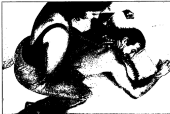
Figure 19-1: Sitting on top of your partner is great in sensual massage.

In therapeutic massage, you usually bring just your hands and arms into contact with your partner, for the most part. In sensual massage, on the other hand, it doesn't matter how much of your body comes into contact with your partner. In fact, the more contact the better, as shown in Figure 19-1. For massage maneuvers applied to the back, the neck, and the head, sit right down on your partner's tush. Just make sure not to rest all your weight on him, though, because you may cut off the circulation.