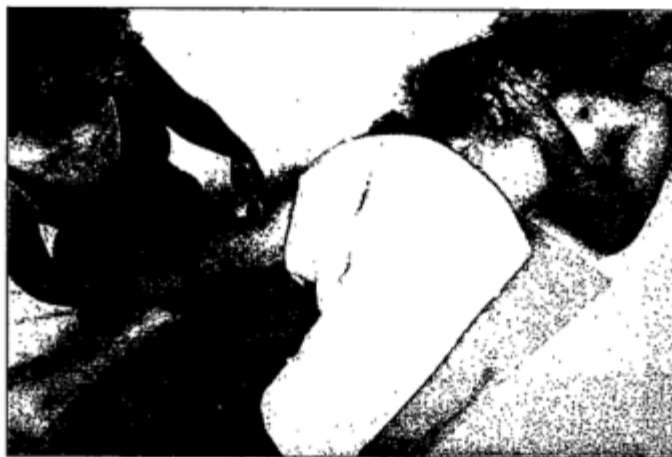
Figure 19-2: Sensually draping your partner's limbs over your body adds to the experience.

When you're massaging your partner's limbs, let the entire leg or arm rest across your body. This creates a sensation of support and intimacy, especially when you combine it with light, lacy moves with your fingertips on the inner thigh area, as shown in Figure 19-2. Ooh la la!